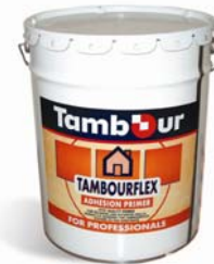
TambourFlex Primer For Good Adhesion

Coating Exterior Walls (6-8 m 2 / Liter)