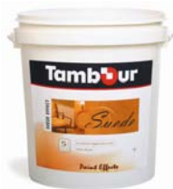
Suede Interior and Exterior