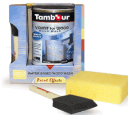
Varnit for Wood