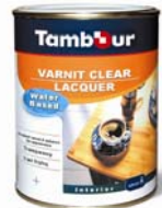
Varnit Clear Lacquer