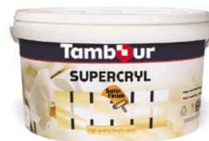
Supercryl Eggshell Finish