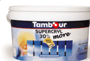
Supercryl (matt) 30% more coverage