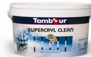
Supercryl Clean (matt) For Kids room and corridors