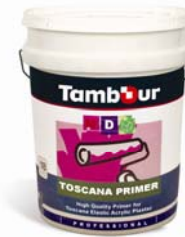
Toscana Primer Acrylic Plaster

Exterior & Interior Paint (12 m 2 / Liter in one coat)