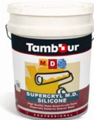
Supercryl M.D. Silicone High Quality