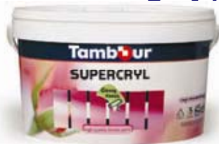
Supercryl Glossy Finish