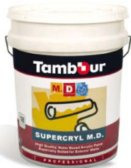
Supercryl M.D. High Durability

Coating Exterior Walls (Fine, Medium, Coarse)