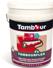
TambourFlex Flexible Paint

Coating Exterior Walls (6-8 m 2 / Liter)