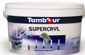
Supercryl Matt Finish