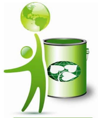
Tambour Green Label Low VOC