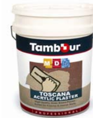
Toscana Acrylic Plaster

Exterior & Interior Paint (12 m 2 / Liter in one coat)