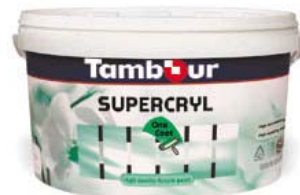
Supercryl Easy in One Coat