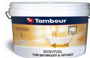
Acrymol (matt) For bathroom & Kitchen